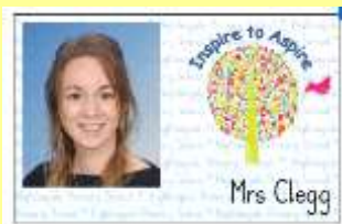
Early Years Lead