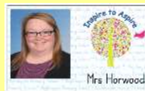
Kingfisher Learning Coach EYFS Speech & Language