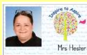
Woodpecker Learning Coach (HTLA)