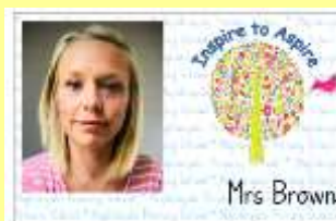
Woodpecker Teacher (Wednesday – Friday)