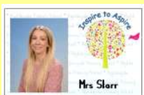
Woodpecker Learning Coach