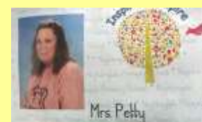
Kingfisher Learning Coach