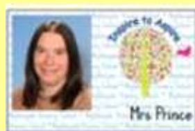
Kingfisher Learning Coach